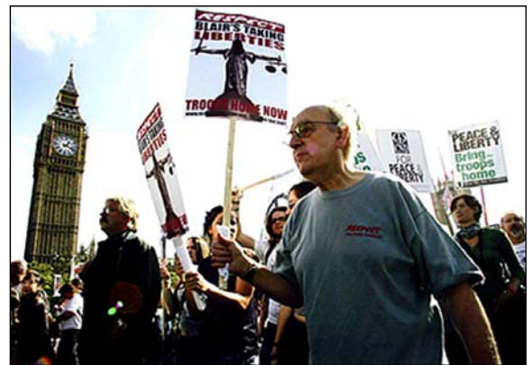
Protests in London, England, against the war in Iraq. Taking part is the Roman Catholic organisation 'Pax Christi'

But don't forget about that other invisible foe, the Vatican. They said from the start that this was an immoral war—and they will not have changed their mind. There was a headline in The Times newspaper (UK) that said it plain and simple: “BRITAIN'S CASE FOR WAR IS UNDERMINED BY THE POPE.” We included that newscutting in our little booklet on this subject entitled “The Battle for the Middle East”—you can see the cutting reproduced on page 45. The Vatican, through its network of lay members is very adept at influencing public opinion, organizing protest marches, letters to media editors and politicians and so on. This works hand-in-hand with those who